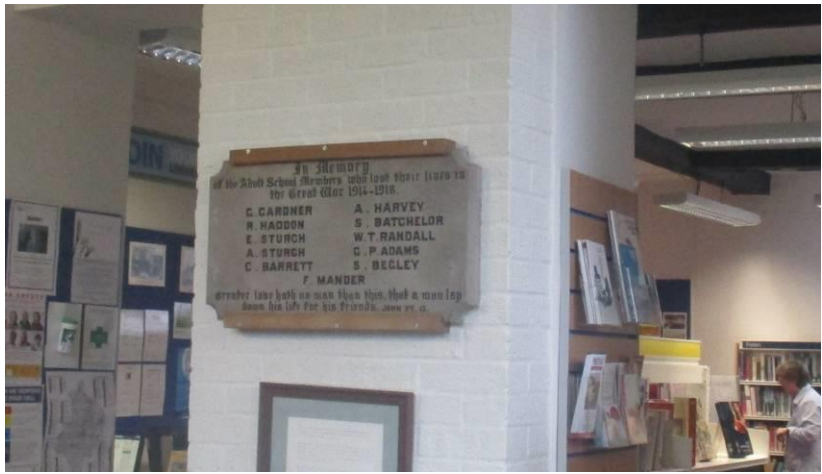
Figure 2: Memorial plaque in commemoration of Adult School members who lost their lives in the First World War

No furnishings of particular note. The meeting house has not been used for a place of worship since 1956 and furnishings were removed at that time. A stone plaque is located within the extension commemorating the Adult School members who lost their lives in the Frist World War.